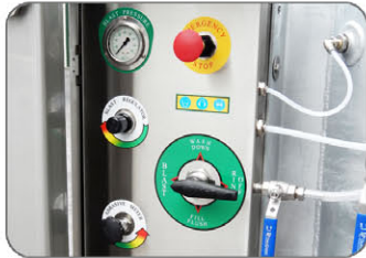
Patent pending engineered TRX Flow Dynamics