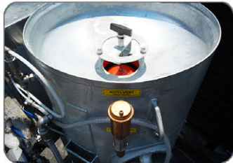
6.5-CF, hot-dipped galvanized, spring-sealed blast pot with auto vent.