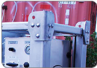
Heavy duty stainless steel frame, forklift/pallet jack pockets, 5x tested lifting eyes.