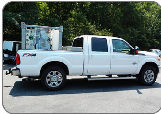
Compact enough to fit in a standard 6' pick up with tool box.