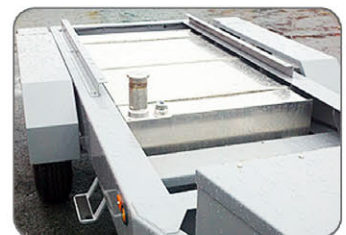
Trailer with built-in 95 gallon aluminum water tank.