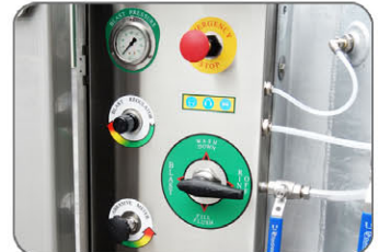
Patent pending engineered TRX Flow Dynamics