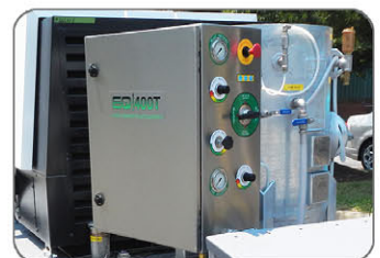
Safety inspired curb side control panel, for easy access.