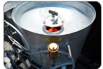
6.5-CF, hot-dipped galvanized, spring-sealed blast pot with auto vent.